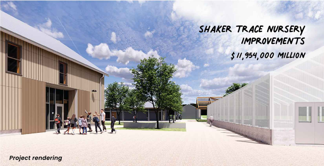
SHAKER TRACE NURSERY IMPROVEMENTS $ 11,954,000 MILLION