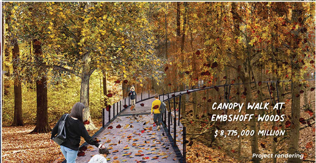
CANOPY WALK AT EMBSHOFF WOODS $ 8,775,000 MILLION