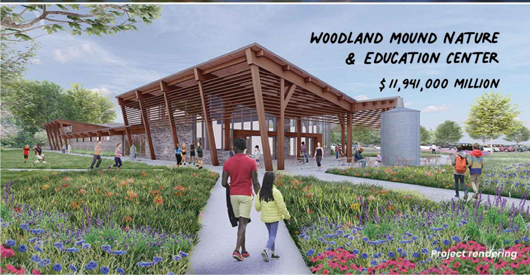
WOODLAND MOUND NATURE & EDUCATION CENTER $ 11,941,000 MILLION