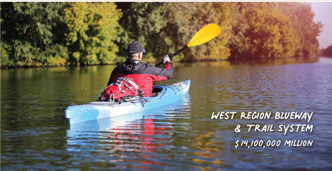
WEST REGION BLUEWAY & TRAIL SYSTEM $ 14,100,000 MILLION